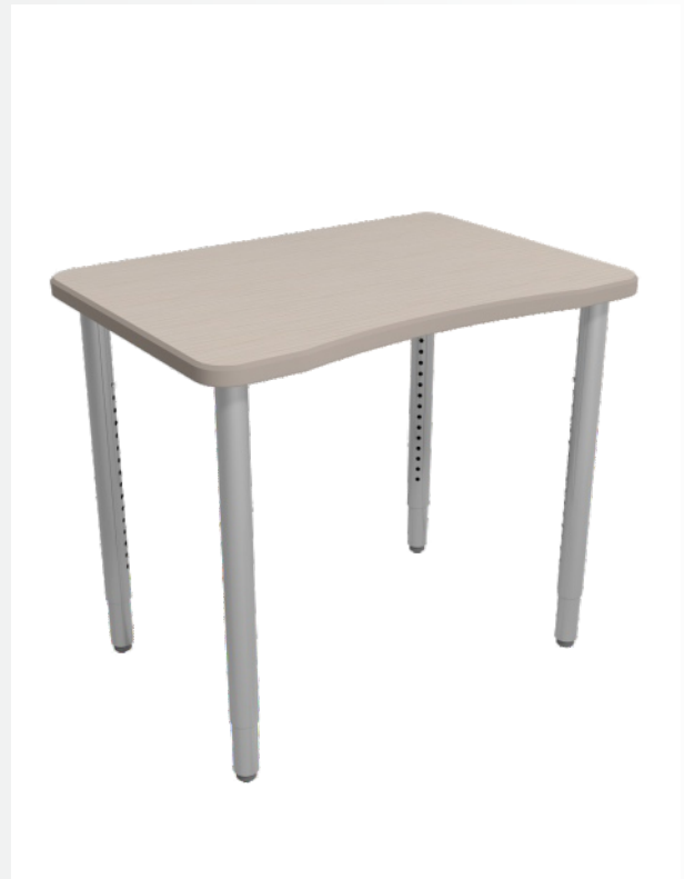
ELO Plymouth II