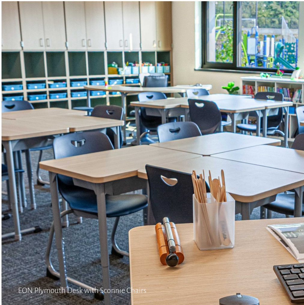
EON Plymouth Desk with Sconnie Chairs

“ Contact SBI for advice and support in matching the right desk or table and seating solutions with specialty education spaces. ”