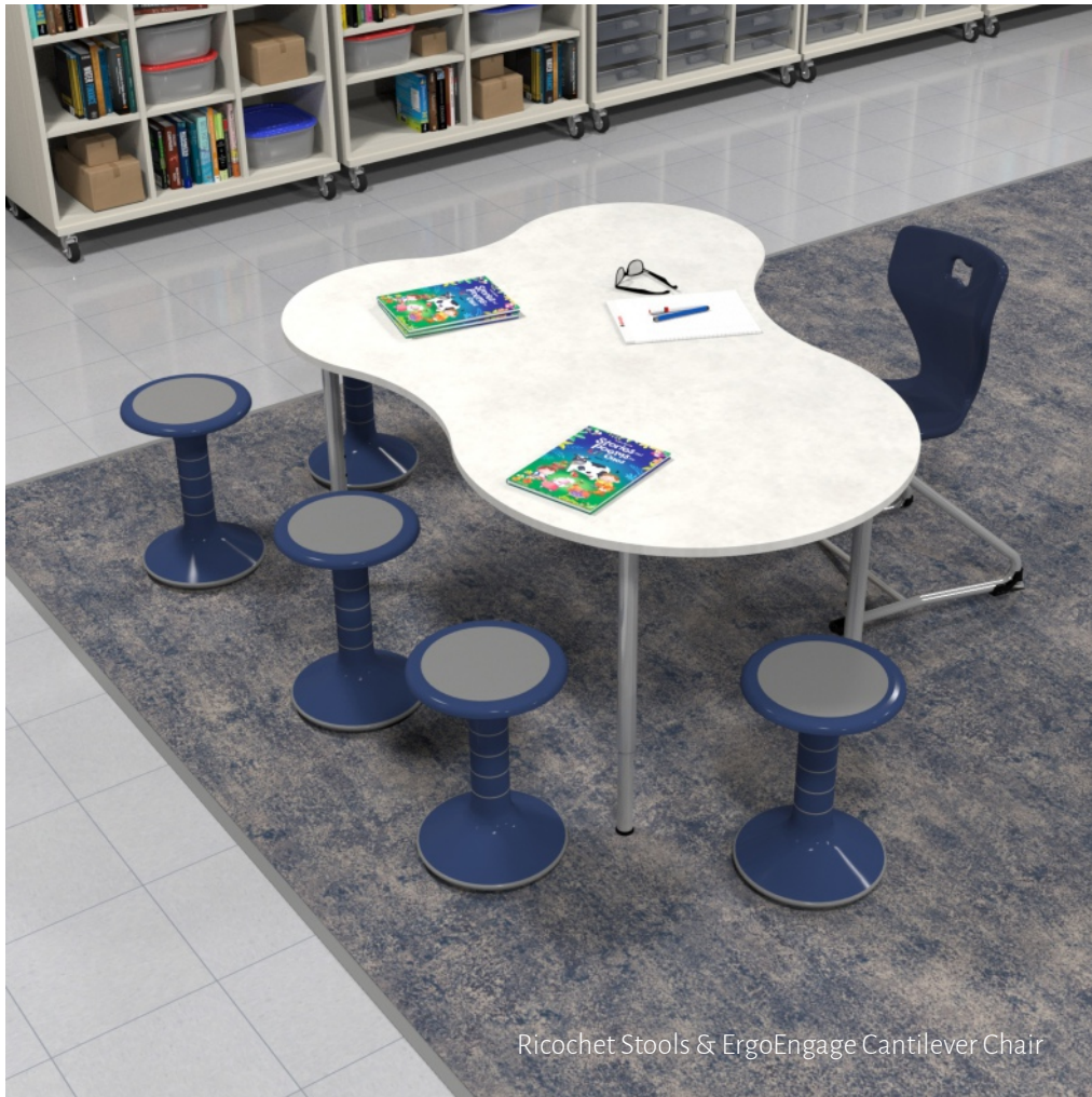
Ricochet Stools & ErgoEngage Cantilever Chair

“ The dynamic wobble seat design of the Ricochet Stool encourages regular changes in sitting positions, activating the body and mind. ”