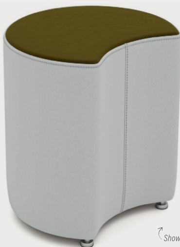
Shown with 1" Nylon Glides

The crescent shape of this ottoman is a conversation starter. If you're looking for a simple way to add extra seating and character to a room without sacrificing design, this is a piece you can't ignore. Relax into it as a footstool or a seat.