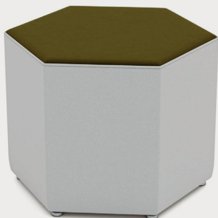
Shown with 1" Nylon Glides

This unique little Honeycomb shape can serve as a single seating space or nest them together to make a Beehive set. These units are light weight enough for the kids to shuffle around and design their own comfortable spaces. Let the kids take control and watch them interact and collaborate to create different designs. This is the perfect seating solution that promotes collaborative and active learning.