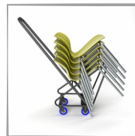
TROLLEY (STACKS 8 (AVAIL. FOR SIZES 5-6))