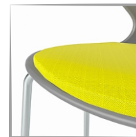
PADDED SEAT (AVAIL. FOR SIZES 5-6) (MOQ 20)