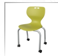
w/ CASTERS (AVAIL. FOR SIZES 3-6)