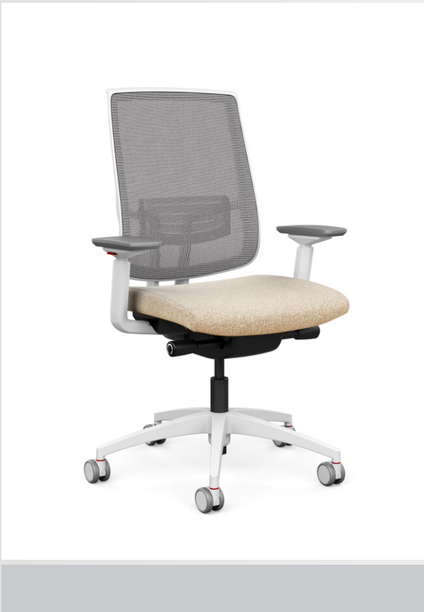
Focus 2.0 Task Chair

Slimmer silhouette, and refined design with synchro swivel-tilt mechanism and adjustable lumbar support for cutting edge ergonomics. With innovative mesh back and lightweight frame.