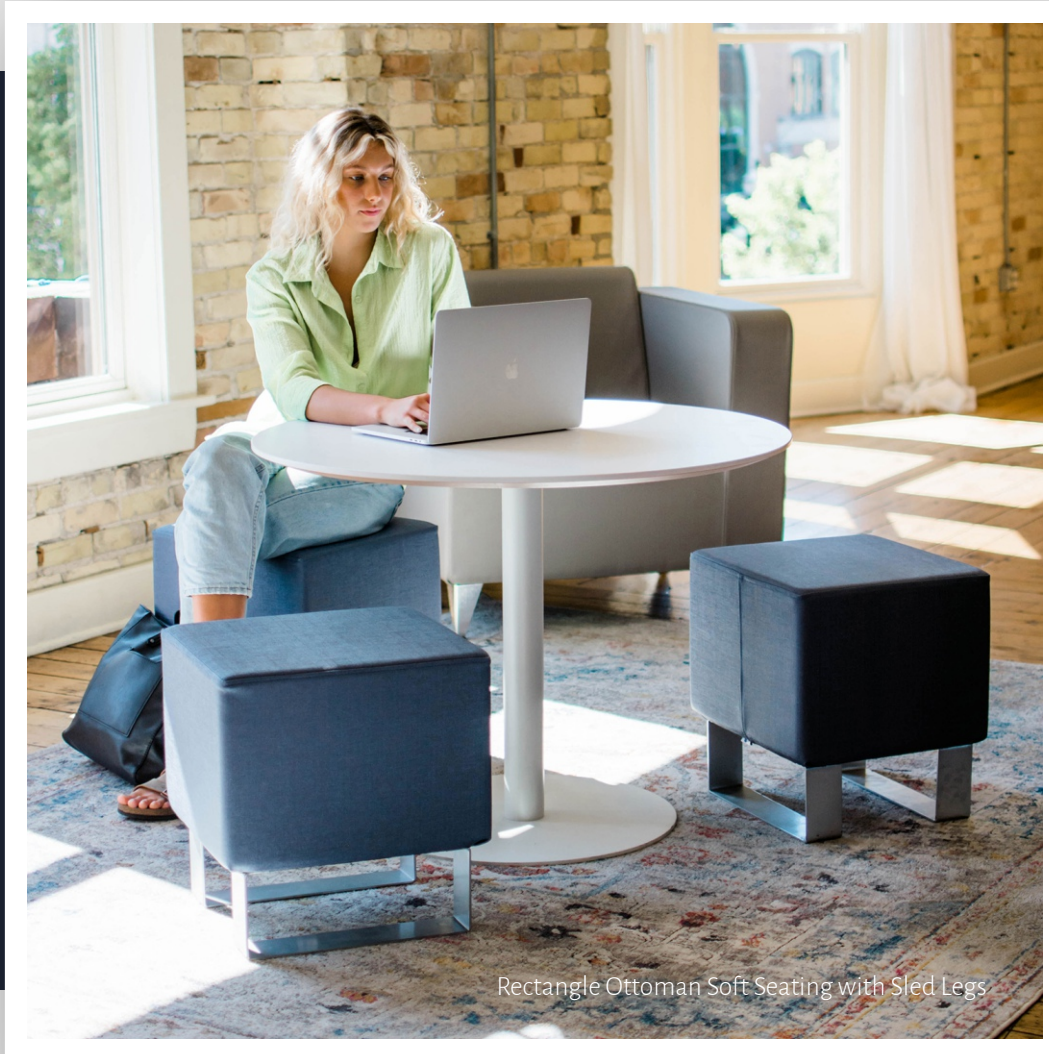
Rectangle Ottoman Soft Seating with Sled Legs

“ Available in a variety of shapes and sizes, foam ottomans offer a rare combination of durability, style, and utility. ”