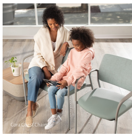
Cora Guest Chairs

Guest and stack chairs that are engineered for cleanability, reliability and durability, while ensuring central comfort.