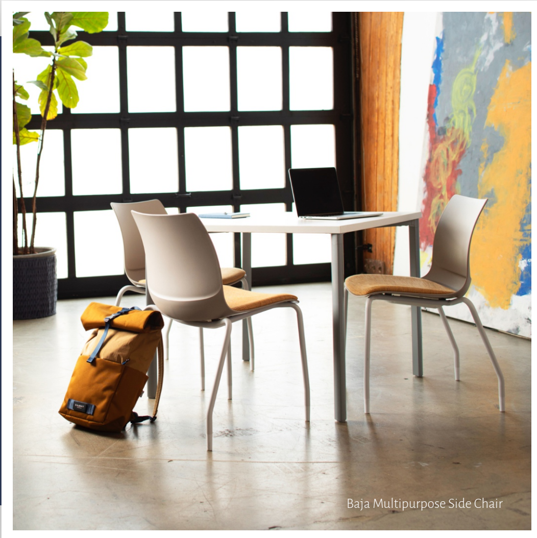
Baja Multipurpose Side Chair

“ When conceptualizing an educational environment, the right seating solution should elegantly organize, unify, and complement the space. ”