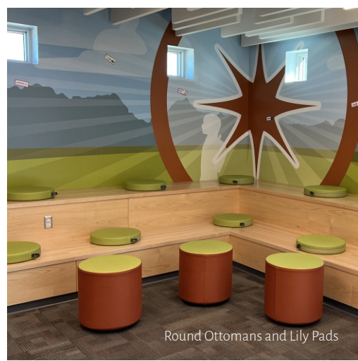
Round Ottomans and Lily Pads

Learning happens everywhere, even on the floor. Give students their own personal, comfortable space to sit.