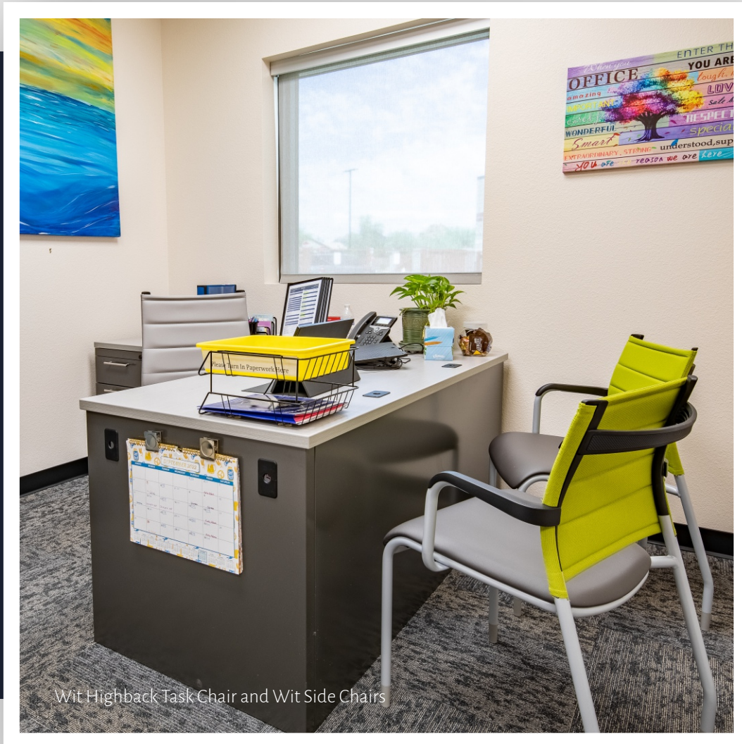
Wit Highback Task Chair and Wit Side Chairs

“ Dynamic environments call for adaptable seating that is inspired and designed by how people work and learn. ”