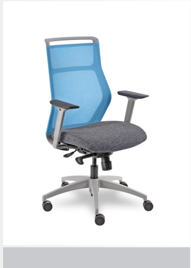
Hexy Task Chair

The hexagon core creates natural support, with an extra-wide backrest. The ultra-supportive performance mesh seamlessly fuses with a lightweight frame. Adjustable armrest options available.