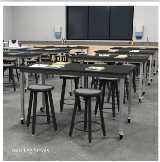
Four Leg Stools

Contact SBI for support and advice in matching the right seating solution with specialty educational spaces.